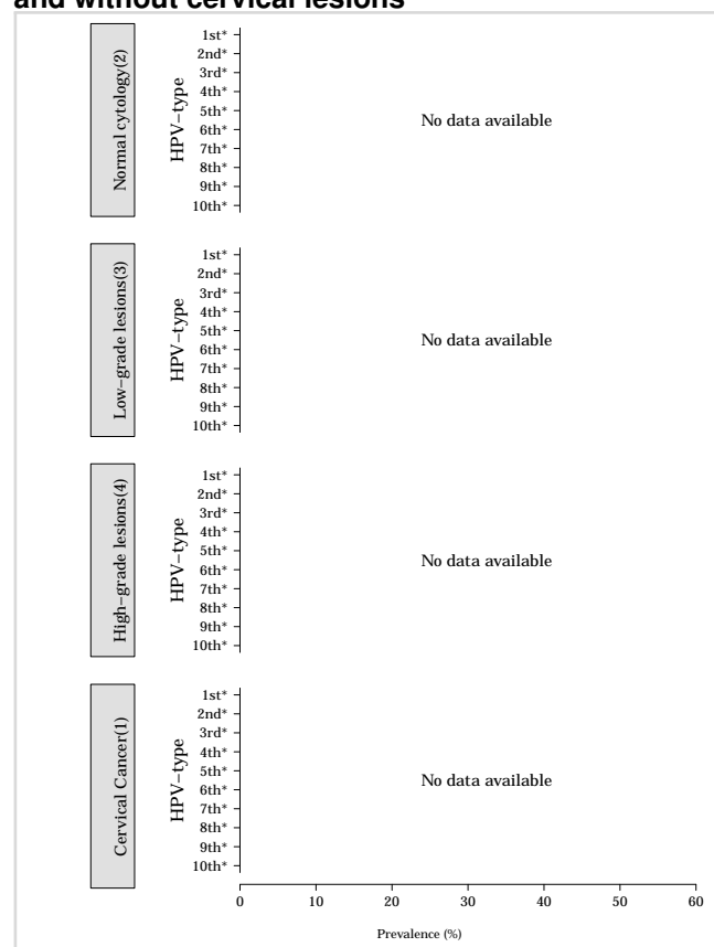
Figure 1. Comparison of the ten most frequent HPV oncogenic types in Seychelles among women with and without cervical lesions

*No data available. No more types than shown were tested or were positive.