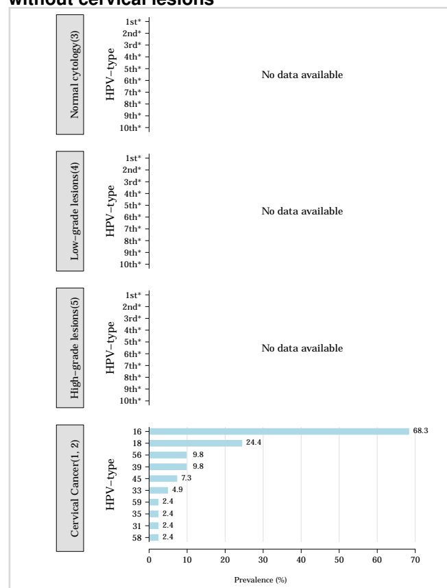
Figure 1. Comparison of the ten most frequent HPV oncogenic types in Jordan among women with and without cervical lesions

*No data available. No more types than shown were tested or were positive.