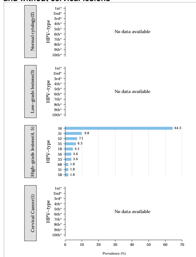
Figure 1. Comparison of the ten most frequent HPV oncogenic types in Fiji among women with and without cervical lesions

*No data available. No more types than shown were tested or were positive.