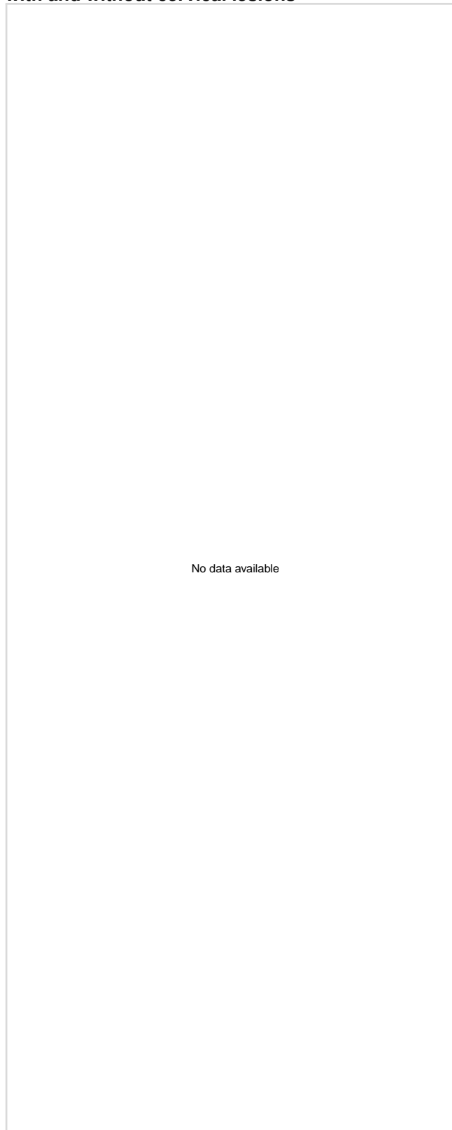
Figure 1. Comparison of the ten most frequent HPV oncogenic types in the Cook Islands among women with and without cervical lesions