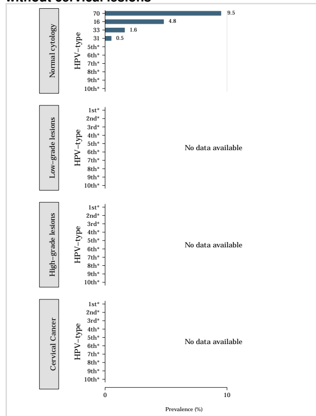
Figure 1. Comparison of the ten most frequent HPV oncogenic types in Congo among women with and without cervical lesions

*No data available. No more types than shown were tested or were positive.